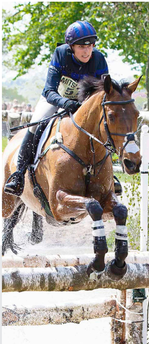
Zara Phillips.