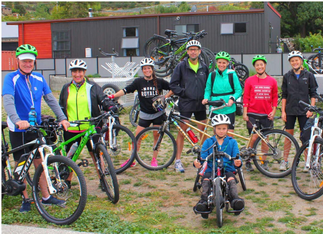
The Pretorius family