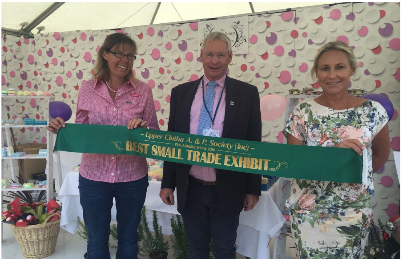
The Caitlins Soap Co - winner of the Best Small Trade Exhibit